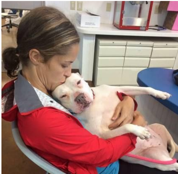
A volunteer spends quiet time with available senior dog, Pixie.

Members of the public don't have to be official volunteers to help us walk the more than 300 dogs in our care and we often reach out to the public when we need extra help. Last year, volunteers contributed a whopping 35,000 hours of service to the shelter! In addition, the volunteer group Friends of Austin Animal Center raised funds and provides support to senior pets as well as special needs cats and dogs.