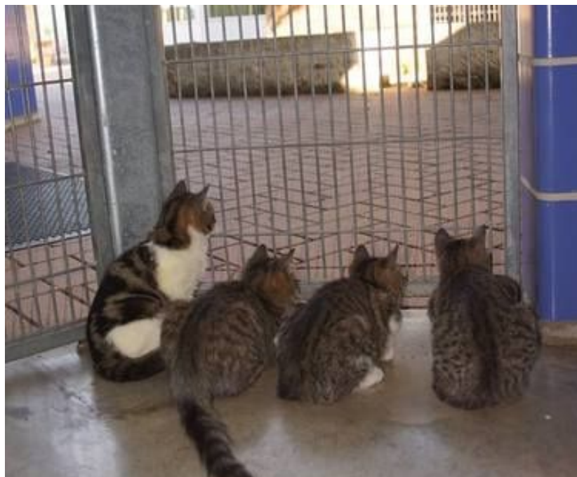
These kittens are hanging out on their 'catio,' in the late afternoon, watching the sparrows in the tree. These enclosed, outdoor areas keep our cats and kittens busy while they wait for new homes.

9. All dogs are equal: In Austin, all dogs are treated as individuals, regardless of perceived breed or type, size, age or health. Dogs who display common behavioral challenges in the shelter are given special attention by staff and volunteers and groups like the Hard Luck Hounds and Dogs Out Loud provide behavioral support, foster homes and advocacy for medium and large shelter dogs.