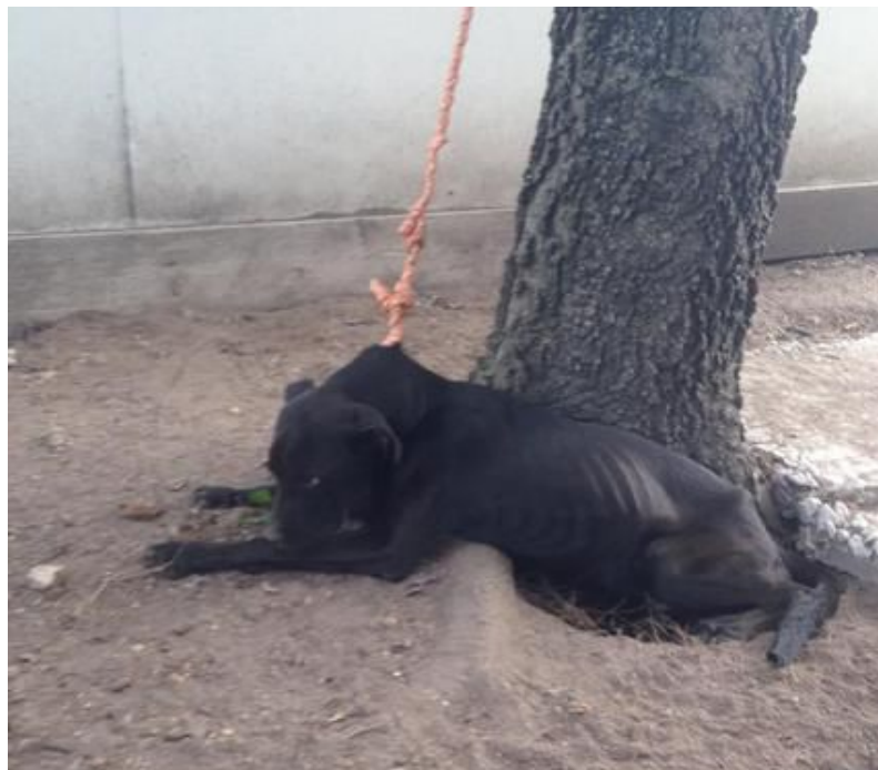
Johnny was found by an animal protection officer, emaciated and tied so tightly he could not lay down. He was rescued and brought to AAC.

Recognizing that the shelter is a highly stressful environment and many of the dogs are traumatized when they come in, the shelter does not use standardized behavioral assessments to make life and death decisions. Instead, we consider the dog's history and behavior in the shelter and in more real life situations like play groups to help us find the best placement option.