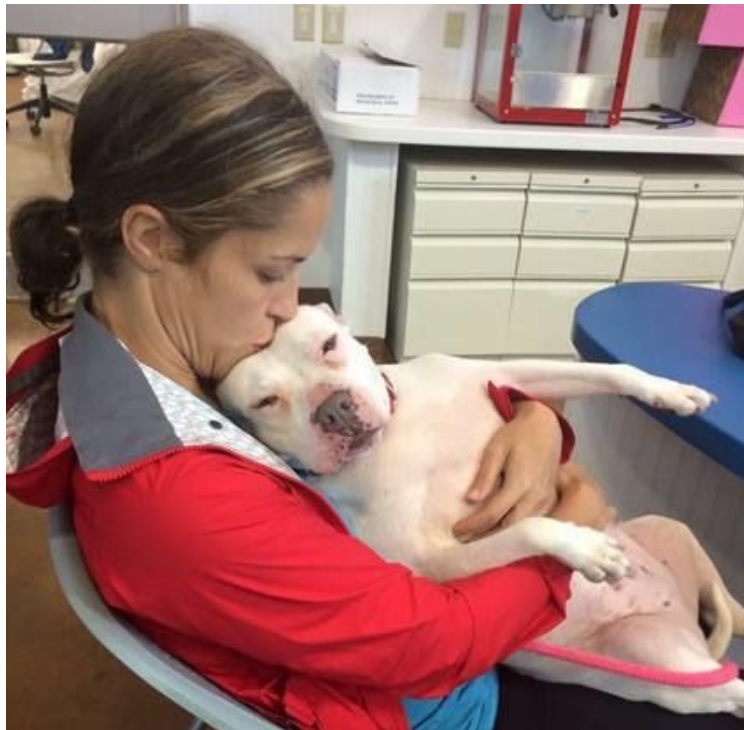
A volunteer spends quiet time with available senior dog, Pixie.

Members of the public don't have to be official volunteers to help us walk the more than 300 dogs in our care and we often reach out to the public when we need extra help. Last year, volunteers contributed a whopping 35,000 hours of service to the shelter! In addition, the volunteer group Friends of Austin Animal Center raised funds and provides support to senior pets as well as special needs cats and dogs.